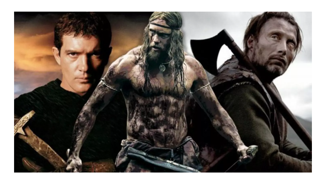
Modern Viking Movies To Watch If You Enjoyed The Northman