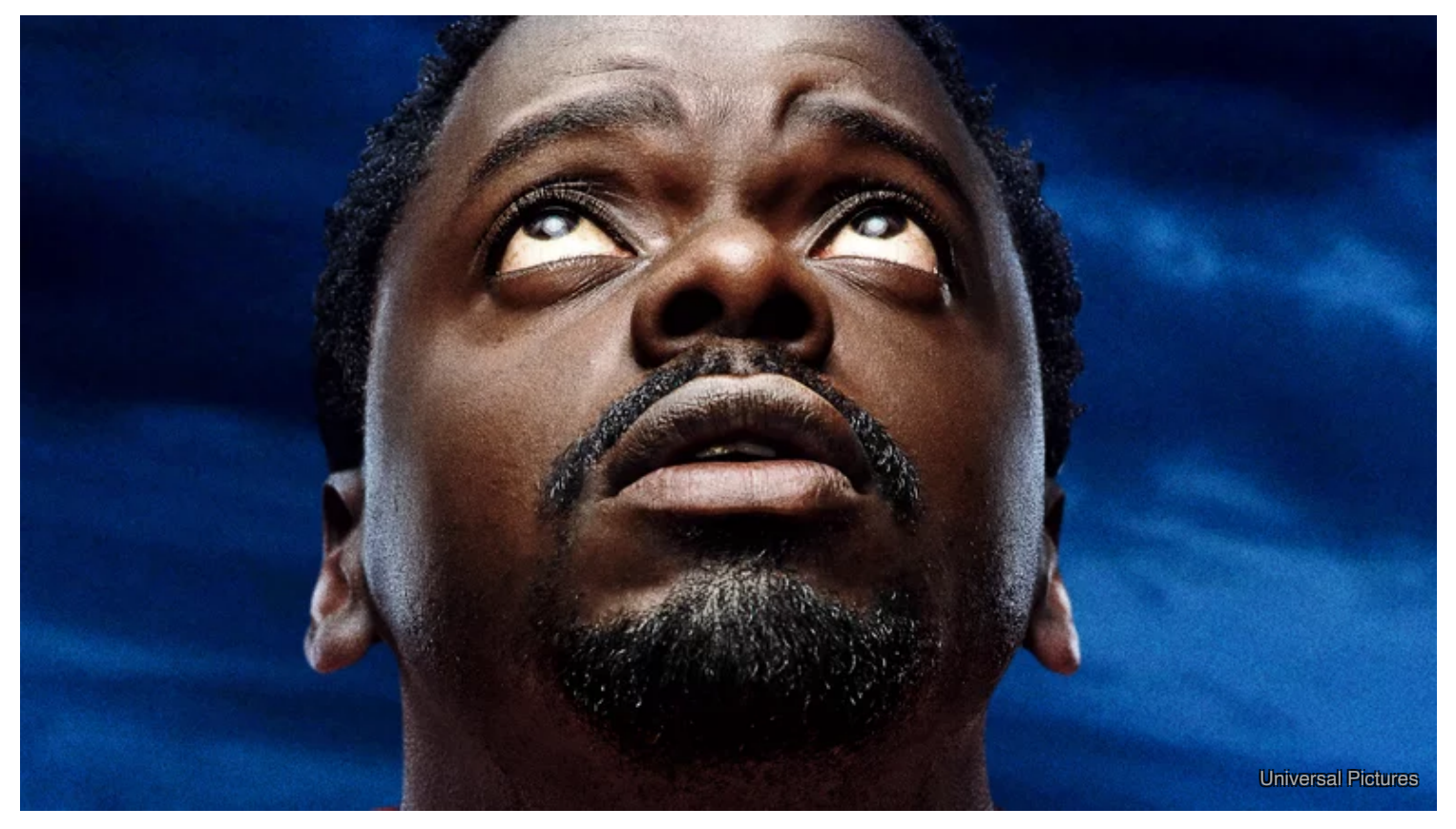
BY DON KAYE / AUG. 8, 2022 11:37 AM EDT

Casual film fans are often familiar with the terms "final cut" and "director's cut," but they may be less knowledgeable about the earlier stages in the process, often referred to as an "assembly cut" and a "rough cut." An assembly cut takes just about all the footage that the director has shot and lays it end to end, with little to no editing or post-production work done on it. This gives the filmmaker the widest possible view of everything captured on camera.